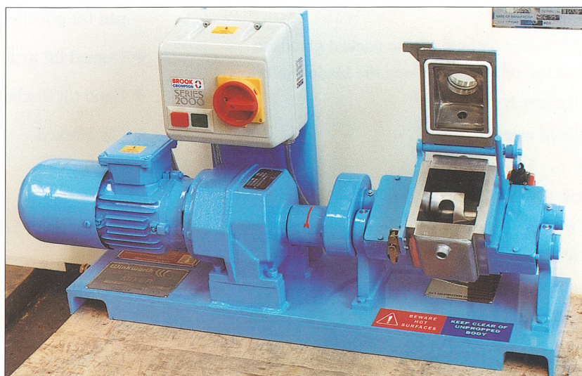
Model AZ – 0.25 litre with steam jacketed trough, vacuum lid and with control panel mounted on mixer and wired